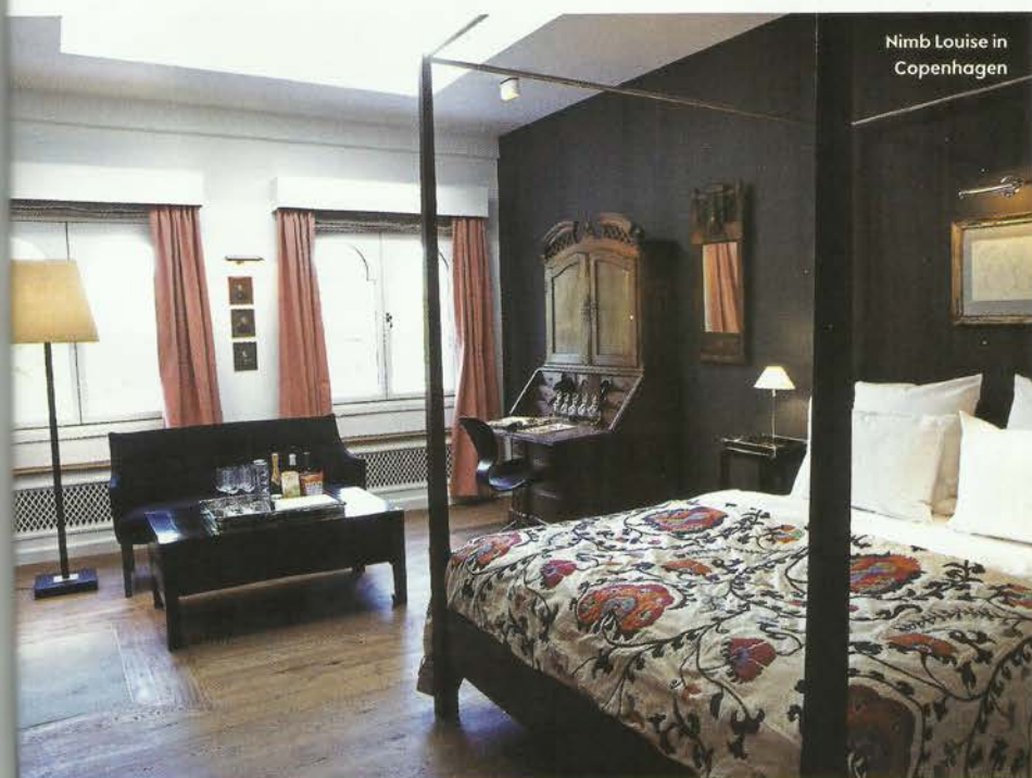
Nimb Louise in Copenhagen

DETAILS Set menus from £80, rooms from £257 b&b; tivoli.dk/nimb